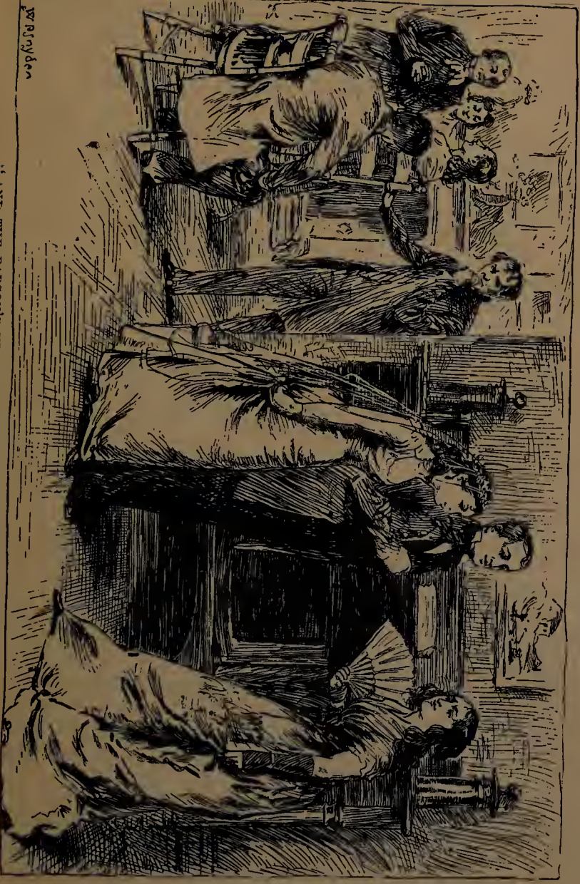
“AND THE PARSON’S VIRGIN DAUGHTER, PLAIN AND SEVERELY PURE, WHO HOPED WE SHOULD BE HAPPY, BUT WASN’T EXACTLY SURE.”